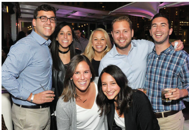
Guests enjoyed a beautiful evening at Godfrey’s outdoor patio