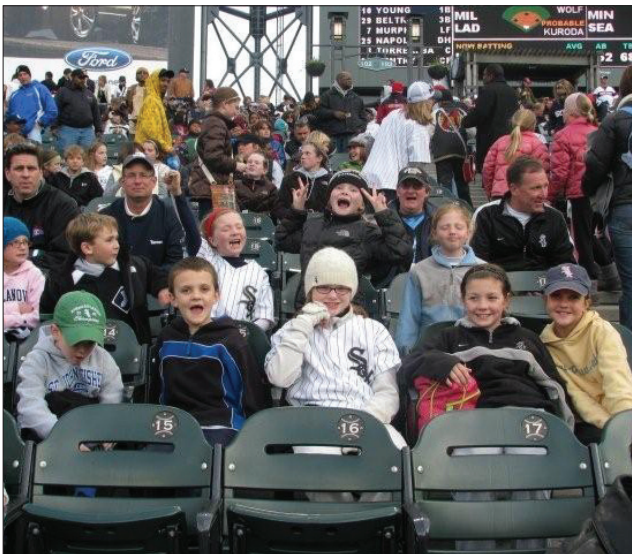
Left, Sox fans enjoying the game.